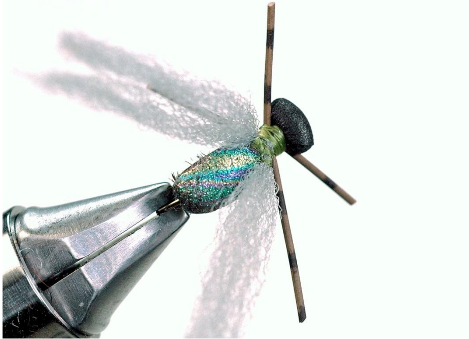
Bottom view of finished fly.

Tie in the wings, legs and some hi-vis material. Trim to size and you are finished.