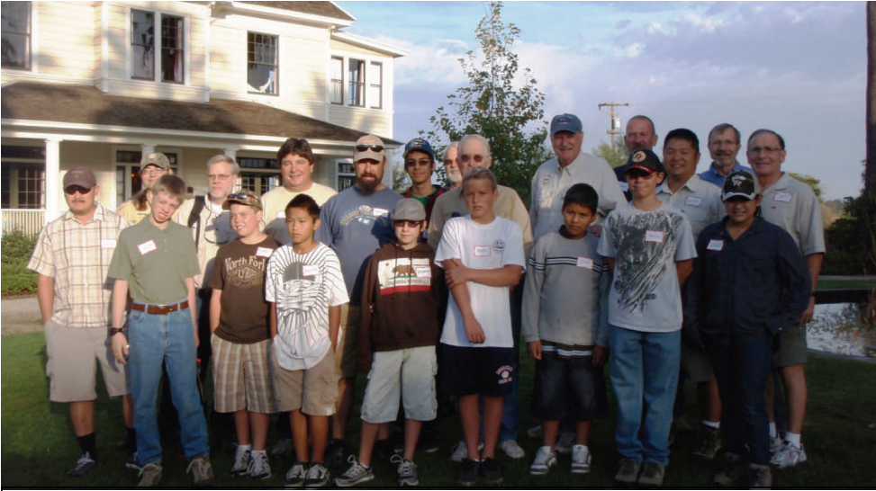
1 st Graduating class of FFFC's Youth Fly Fishing Academy